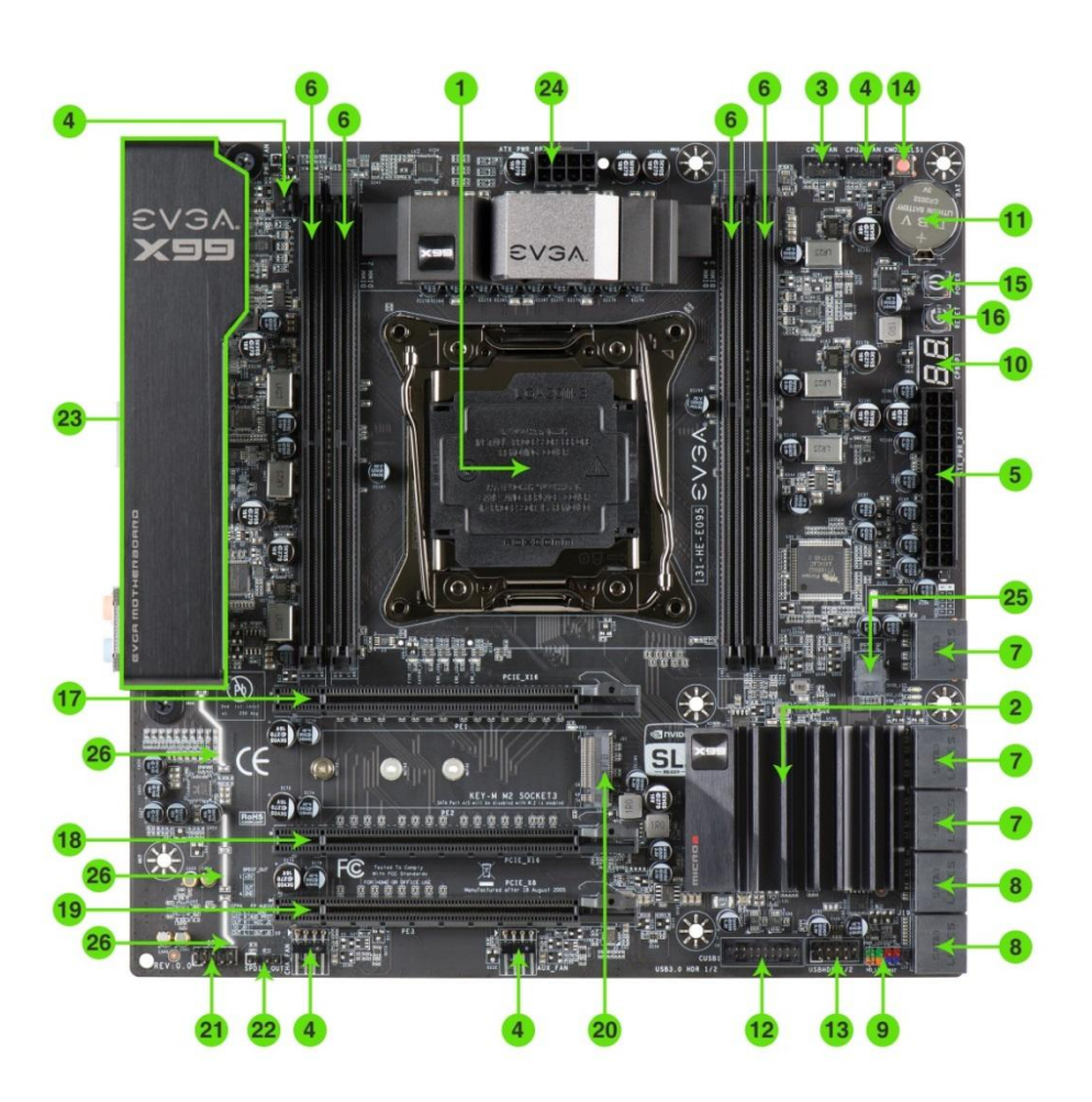
FIGURE 1. X99 Micro2 Motherboard Layout

The EVGA X99 Micro2 Motherboard with the Intel X99 and PCH Chipset and its component breakdown is pictured below. Figure 1 shows the motherboard and Figure 2 shows the back panel connectors